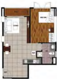
UnitType A2 Room Area 57.21