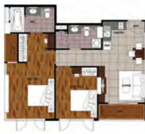
UnitType B Room Area 40.30 SQ.M.