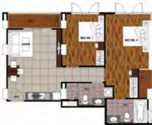
UnitType B1 Room Area 73.42 SQ.M.