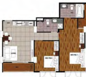
Unit Type B1 Room Area 75.61 SQ.M.