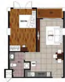
UnitType C2 Room Area 49.00 SQ.M.