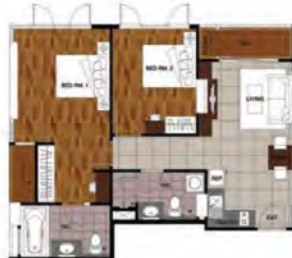
UnitType B Room Area 69.81 SQ.M.