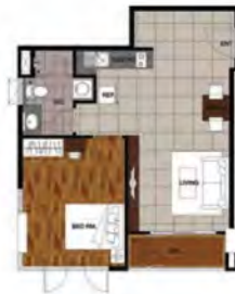
UnitType A1 Room Area 51.50 SQ.M.