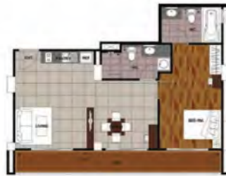
UnitType D Room Area 71.73 SQ.M.