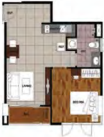
UnitType A Room Area 45.46 SQ.M.