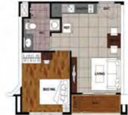
UnitType C Room Area 40.37 SQ.M.