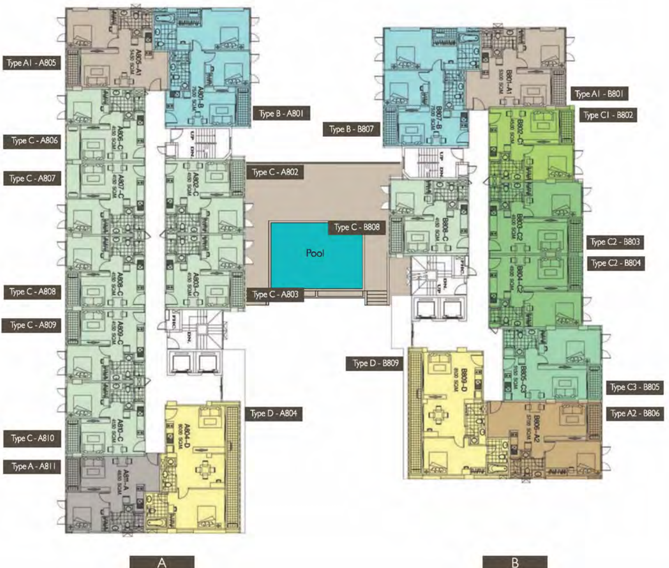
8 th Floor Plan

Hi-Tech Security access control with CCTV